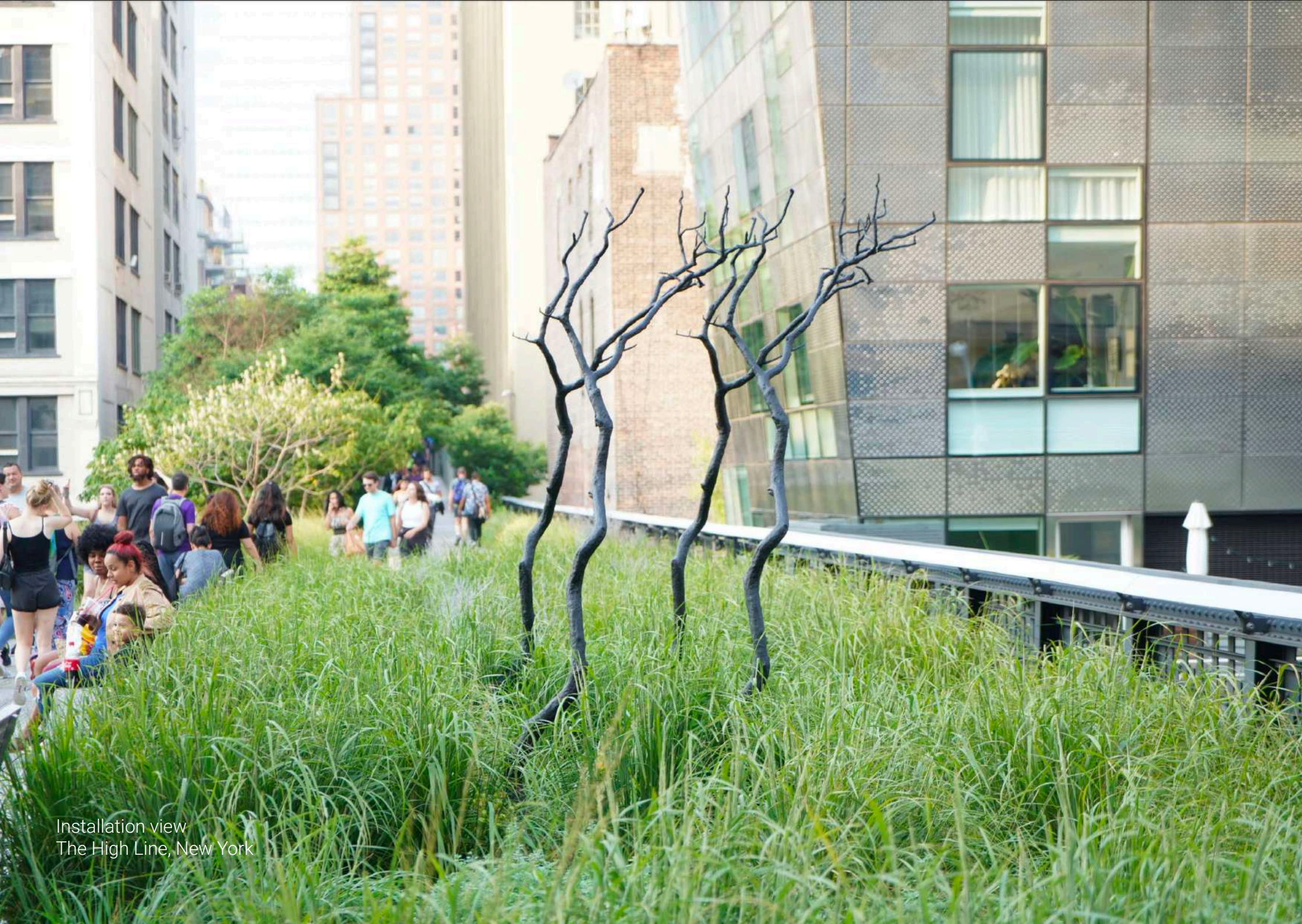
Installation view The High Line, New York