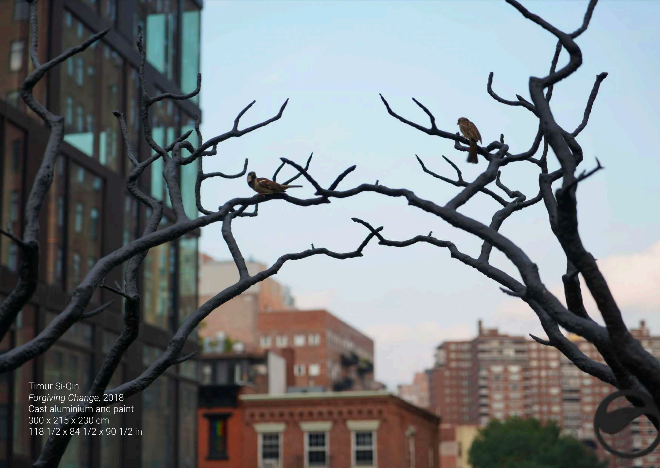
Timur Si-Qin Forgiving Change , 2018 Cast aluminium and paint 300 x 215 x 230 cm 118 1/2 x 84 1/2 x 90 1/2 in