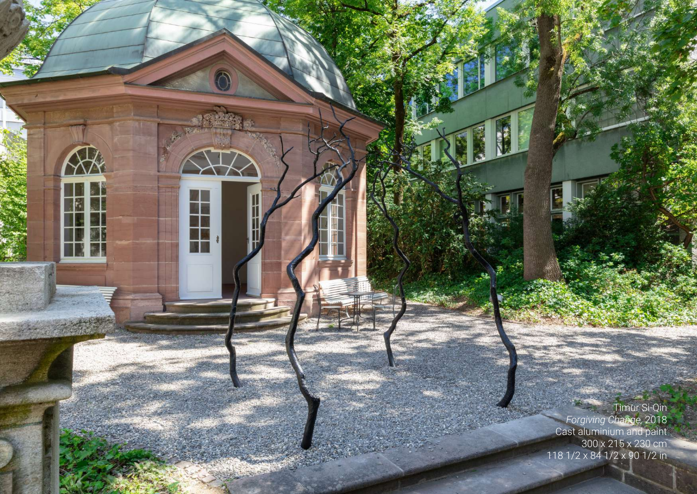
Timur Si-Qin Forgiving Change , 2018 Cast aluminium and paint 300 x 215 x 230 cm 118 1/2 x 84 1/2 x 90 1/2 in