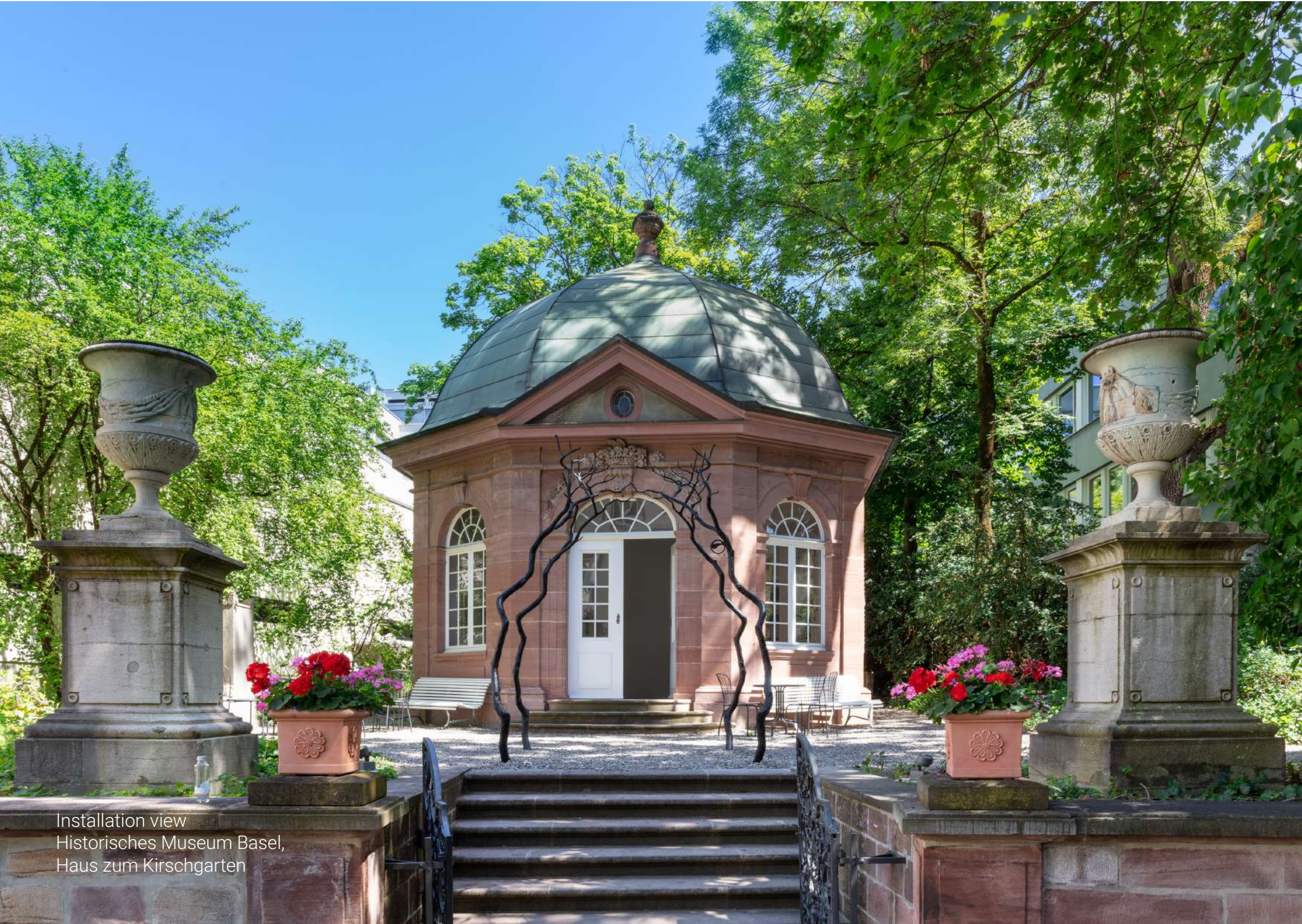
Installation view Historisches Museum Basel, Haus zum Kirschgarten